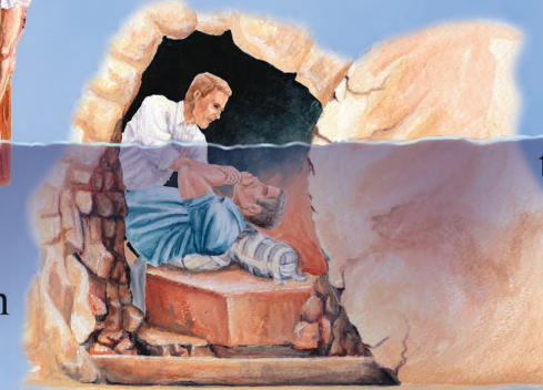
Buried in Water