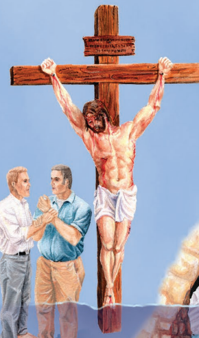
Dead to Sin

In Baptism We Repent of Sin and Die to Sin We are Buried in Water for the Remission of Sins We are Raised to Walk in a New Life